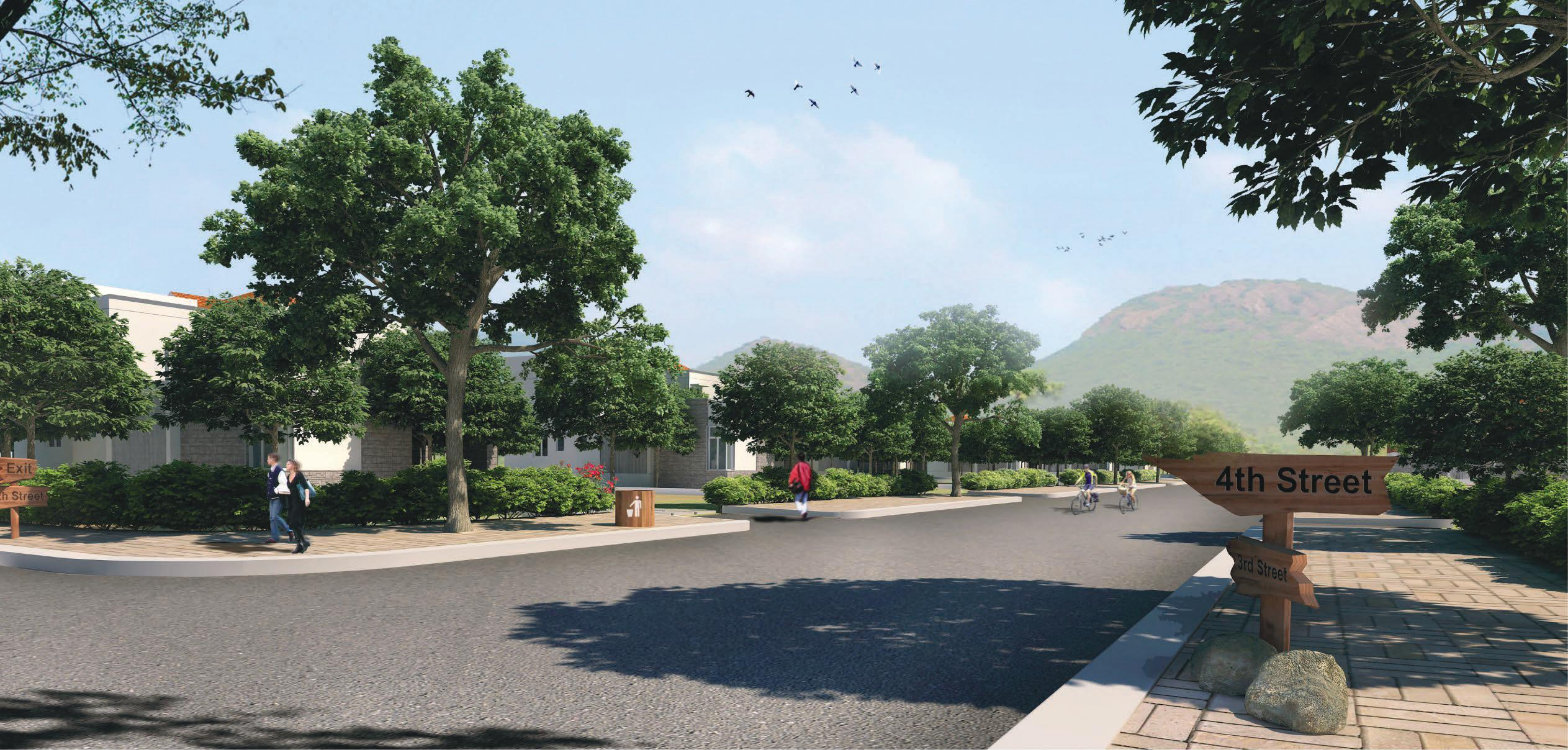
A street view