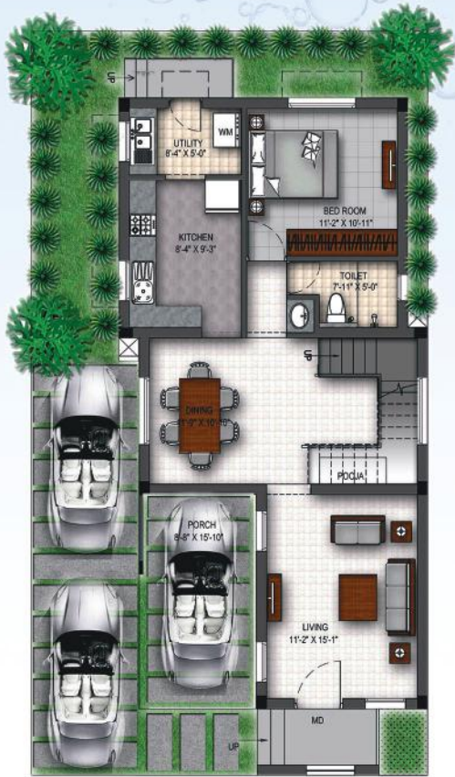
PLOT - 17 GROUND FLOOR

N ▲ Plot Area 1609 Sq.ft Sale Area 2196 Sq.ft