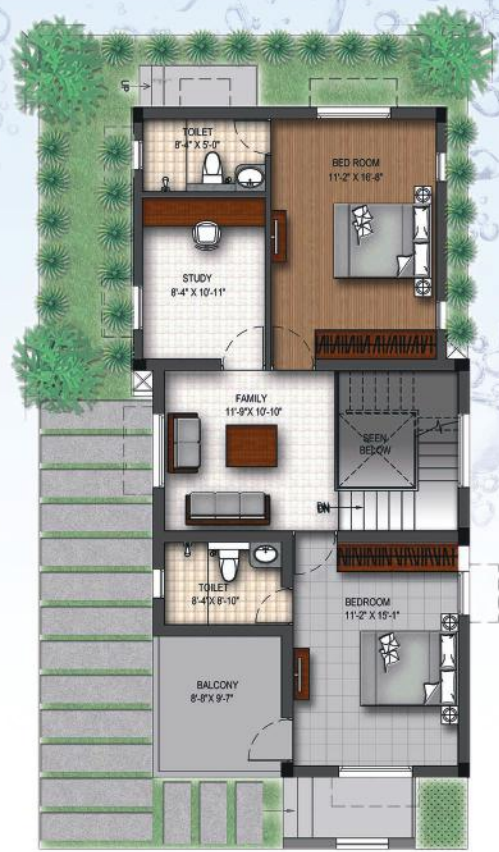
PLOT - 17 FIRST FLOOR

N ▲ Plot Area 1609 Sq.ft Sale Area 2196 Sq.ft