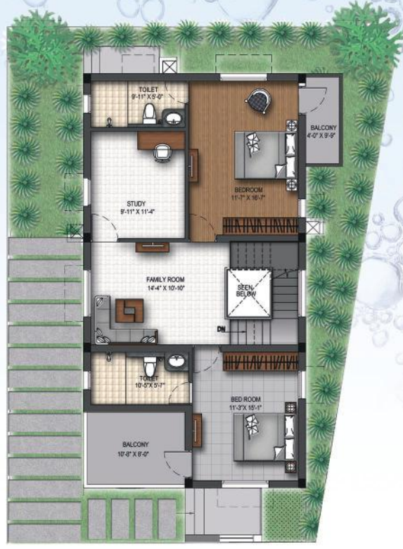
PLOT - 14 FIRST FLOOR