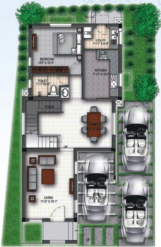
PLOT - 22 GROUND FLOOR

N Plot Area 1815 Sq.ft Sale Area 2153 Sq.ft