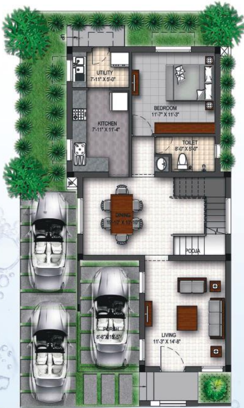
PLOT - 16 GROUND FLOOR

N Plot Area 1605 Sq.ft Sale Area 2217 Sq.ft