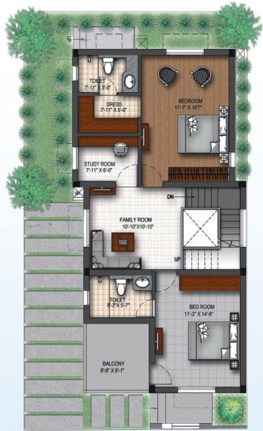
PLOT - 16 FIRST FLOOR

N Plot Area 1605 Sq.ft Sale Area 2217 Sq.ft