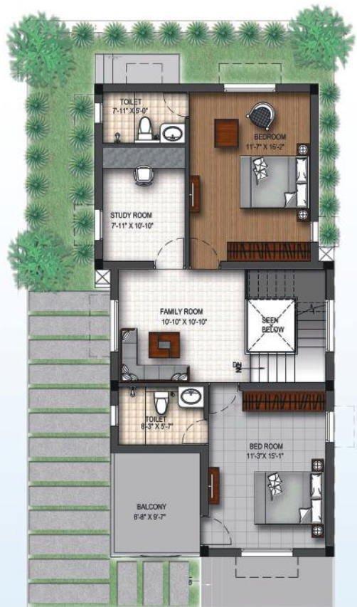
PLOT - 18 FIRST FLOOR

N ▲ Plot Area 1609 Sq.ft Sale Area 2207 Sq.ft