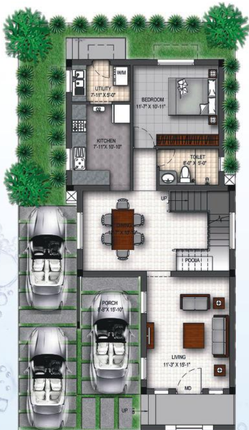
PLOT - 18 GROUND FLOOR

N ▲ Plot Area 1609 Sq.ft Sale Area 2207 Sq.ft