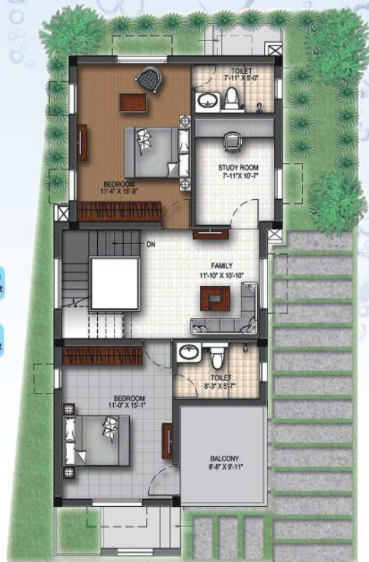
PLOT - 22 FIRST FLOOR

N Plot Area 1815 Sq.ft Sale Area 2153 Sq.ft